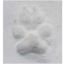
Wolf Track

Help the DNR track and monitor Wisconsin's wolf population and other forest carnivores by conducting surveys of winter tracks left in the snow. These surveys are used to determine the abundance and distribution of animals such as fishers and bobcats, in addition to wolves. Also, they can indicate the existence of rare carnivores such as Canada lynx, cougar, and wolverine. Find out the guidelines to becoming a tracker and other information at the WDNR website: